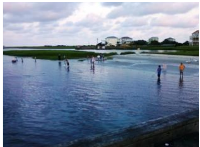
Sea Scouts crabbing