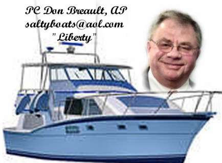
"Liberty"

The annual 2014 Fourth of July celebration and patriotic boat race event was coming up in a few days. Now the outcome of today’s drag race has still not been settled. One boat is either the remaining king of the lake or the other one is a new king of the lake. If you want to really find out who has the fastest pontoon boat on Lake Norman, you will have to read the results in next month’s edition of the “Fish House Chronicles”.